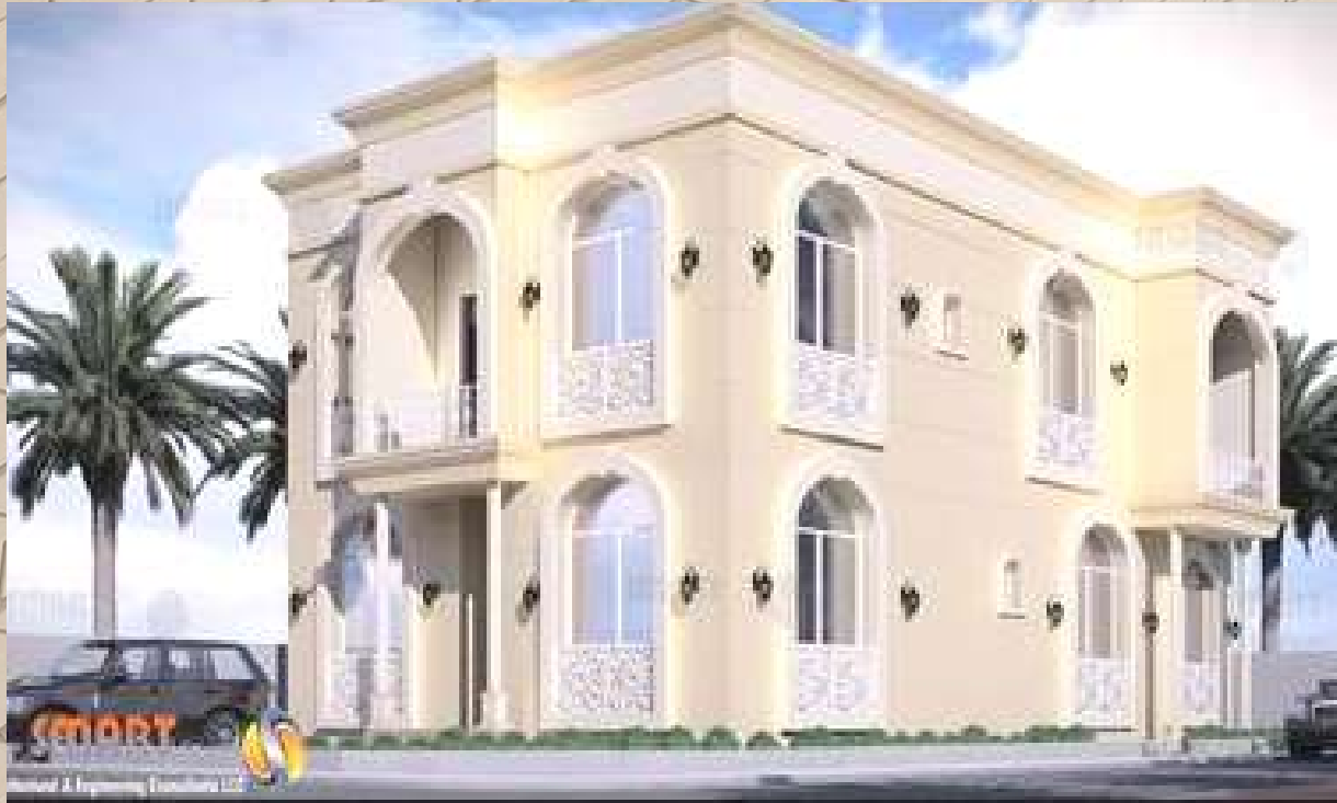
0589 (G+1 VILLA) MANAMA