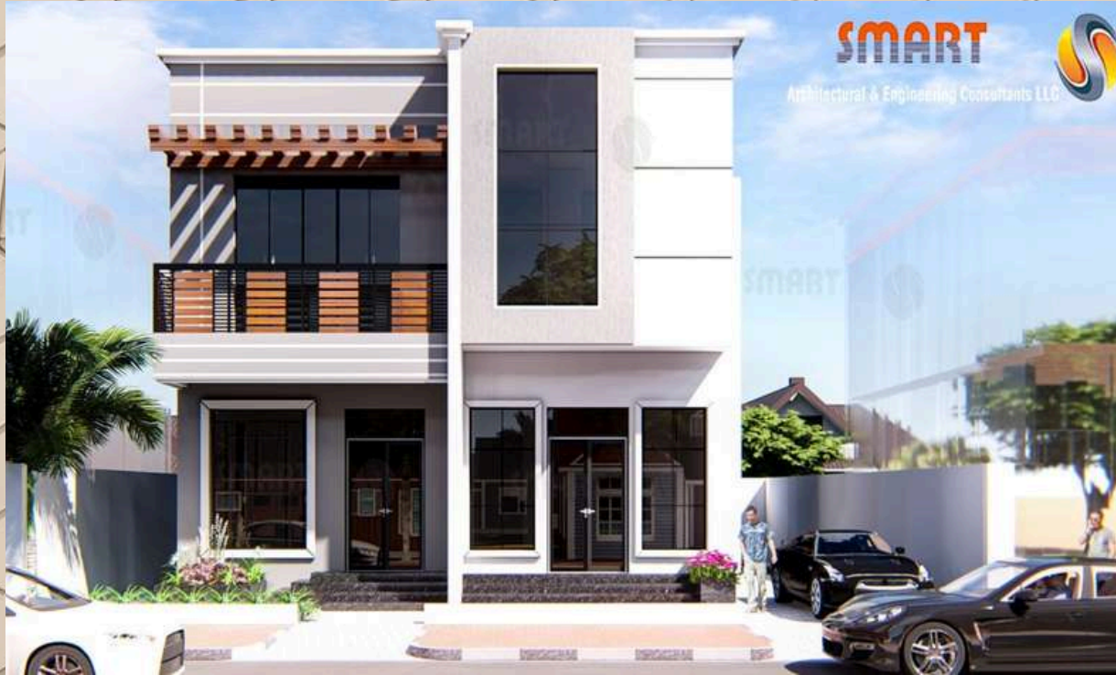
1081 & 1272 (G+1) VILLA YASMEEN