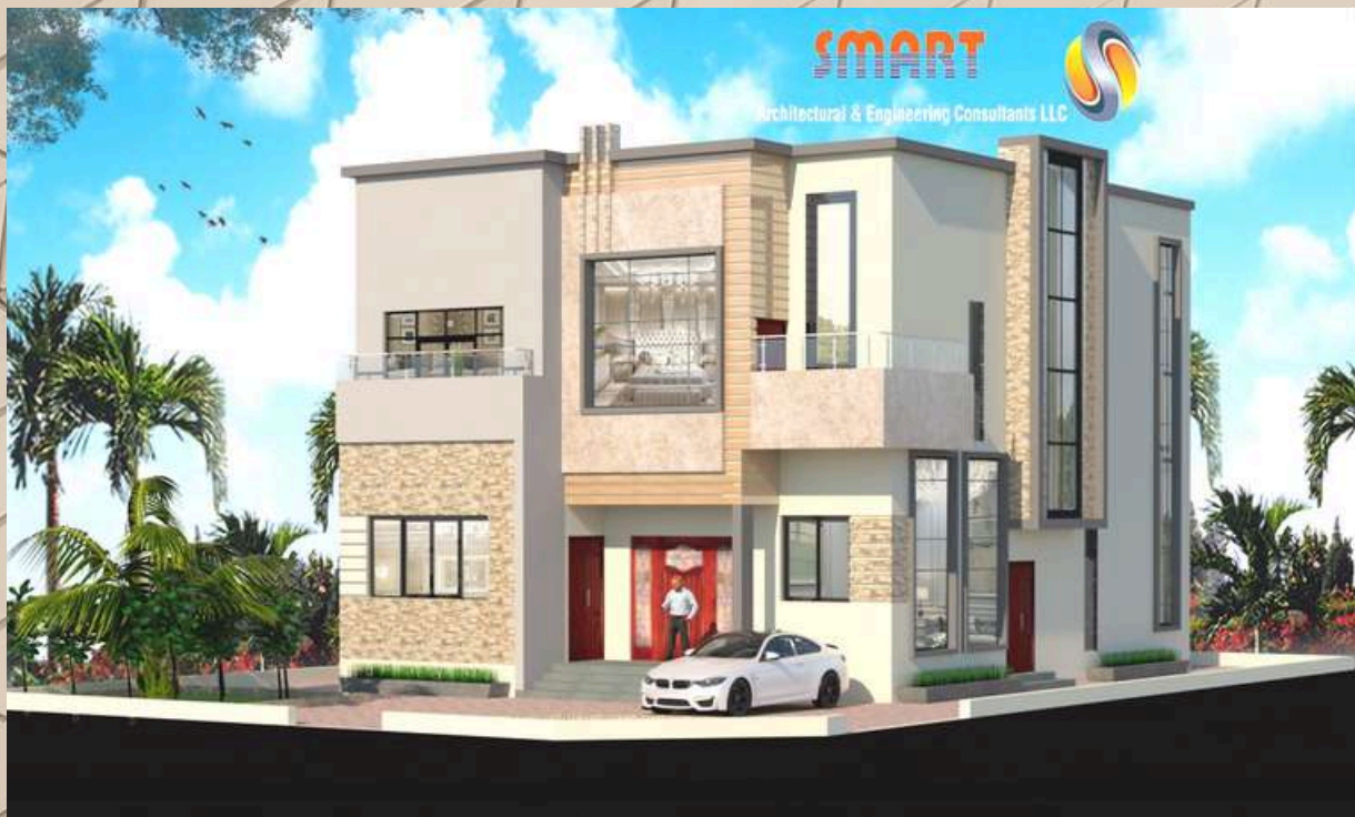
2311 (G+1) VILLA AALIA