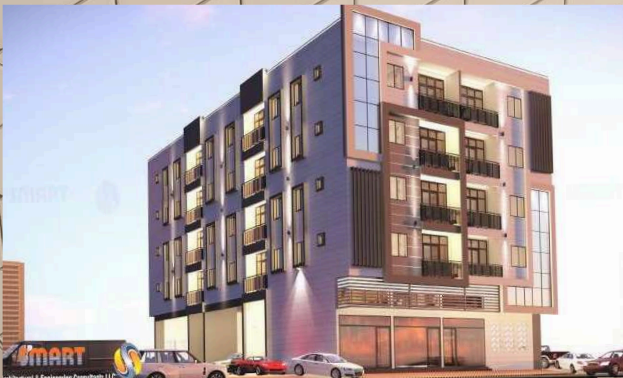
0194 (G+4) BUILDING AL JURF 3 AJMAN