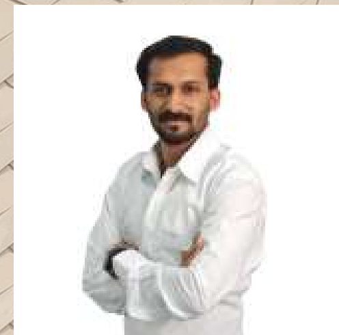
(CIVIL ENGINEER) (CIVIL ENGINEER)