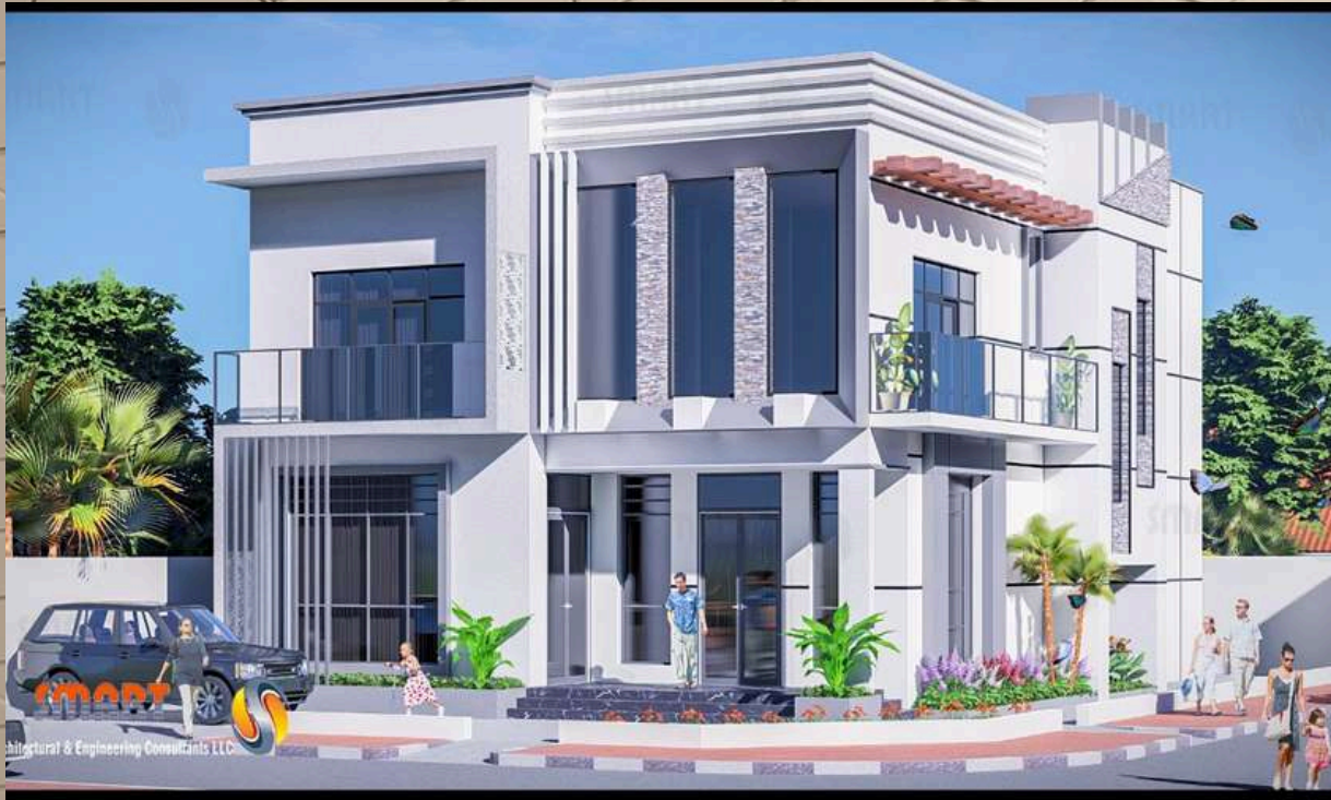
2980 (G+1) VILLA AALIA