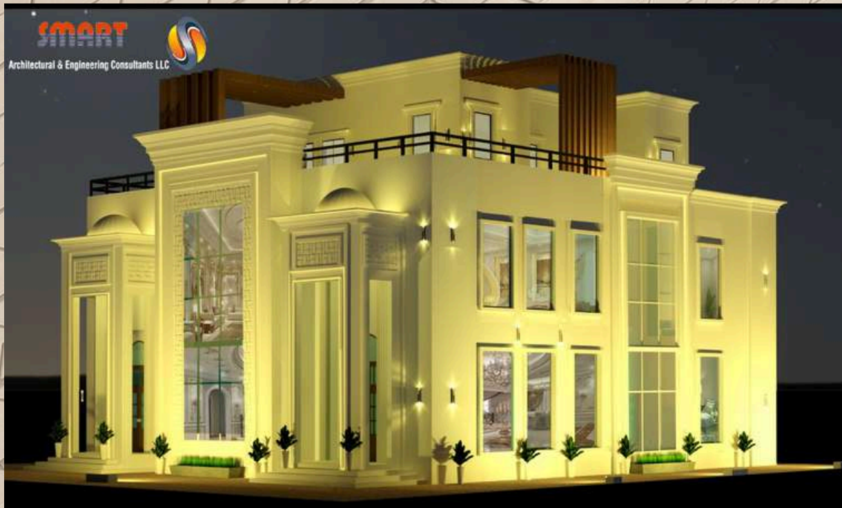
(G+2) VILLA RAGAYEB 2