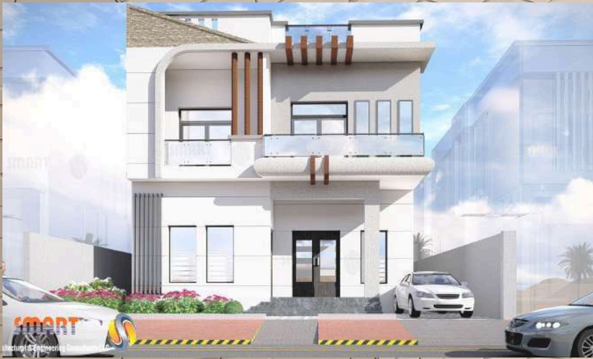
3397 (G+1) VILLA YASMEEN