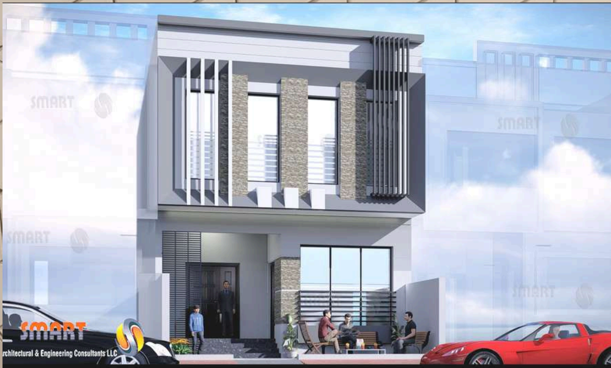
2957 (G+1) VILLA YASMEEN