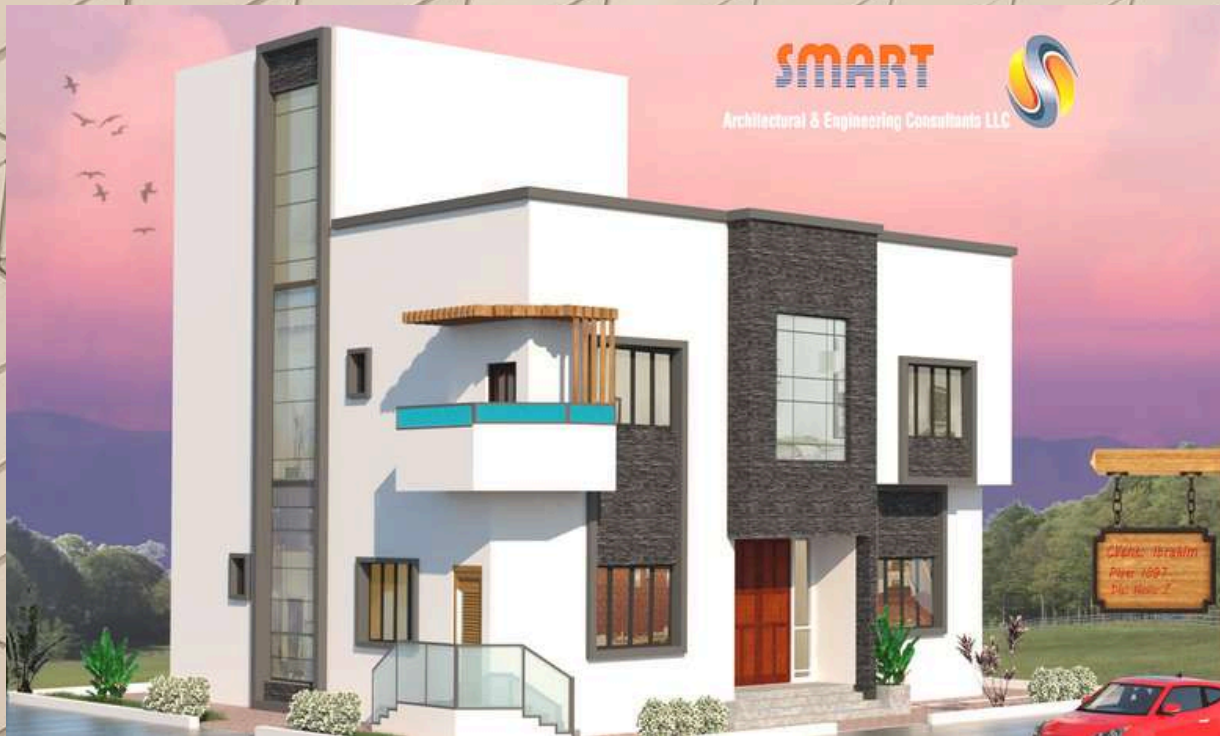
1897 (G+1) VILLA HUMAIDEYA 1