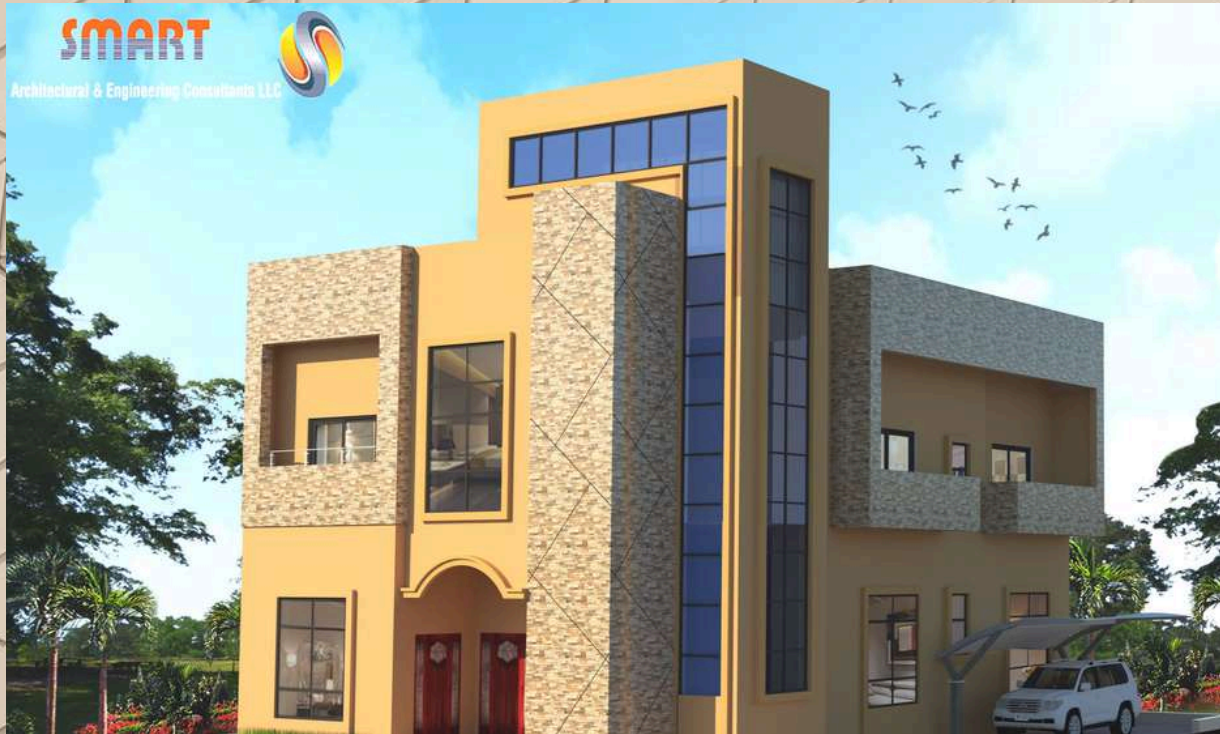
1688 (G+1) VILLA YASMEEN