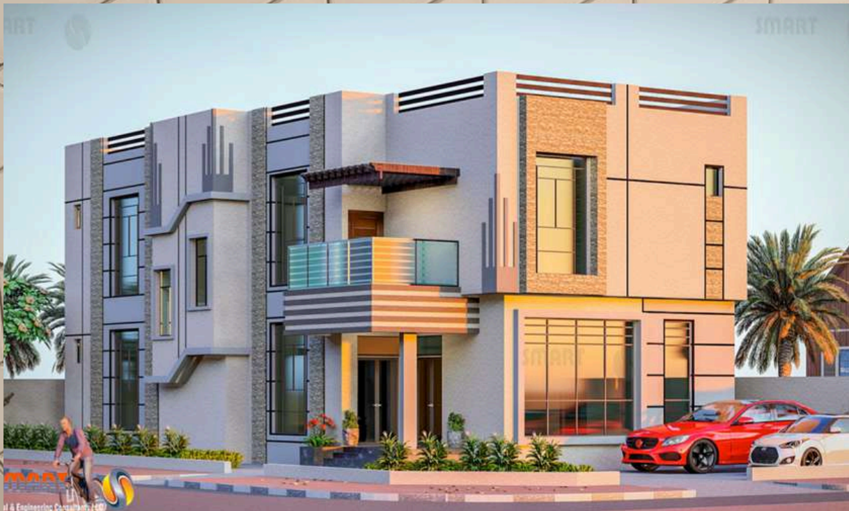
3052 (G+1) VILLA AALIA