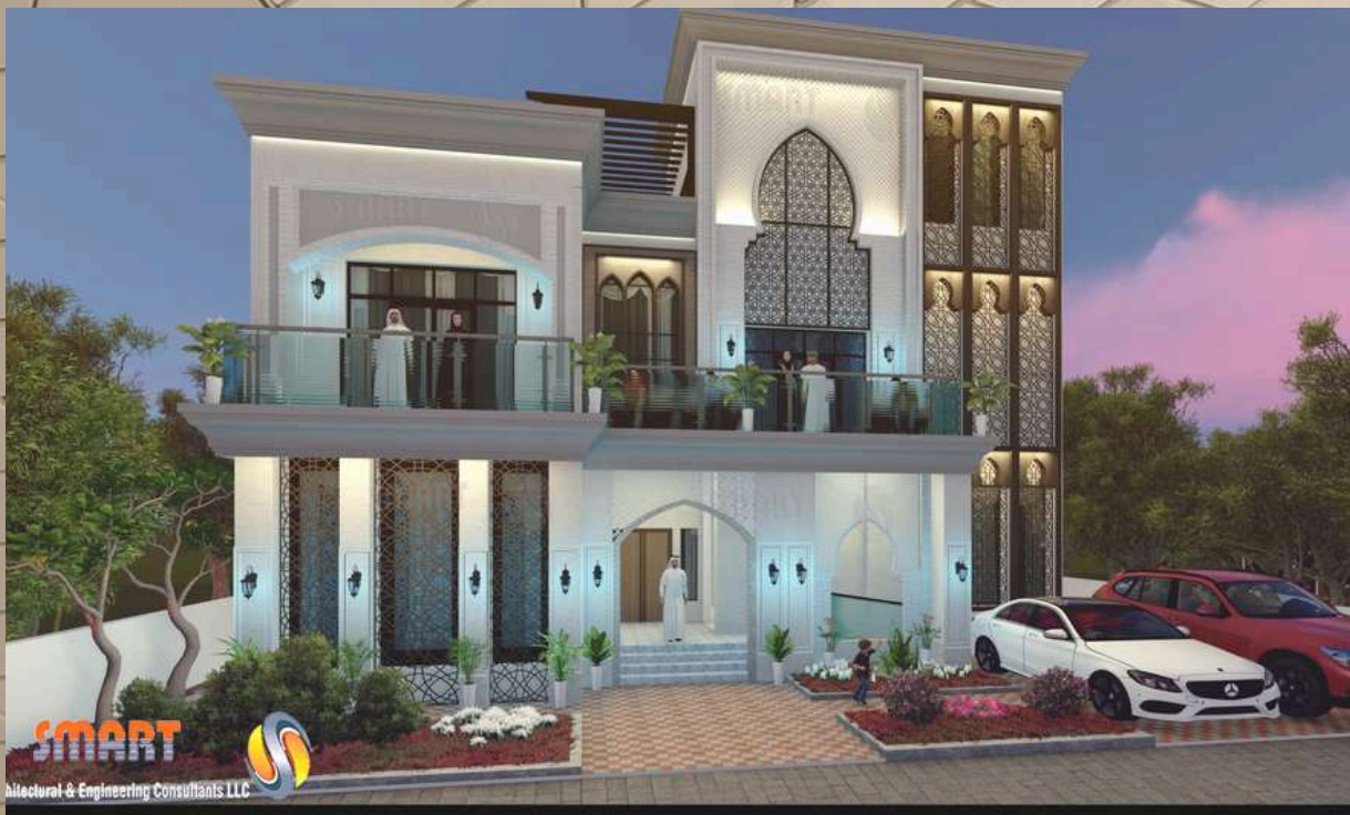
2069 (G+1) VILLA HELIO 1