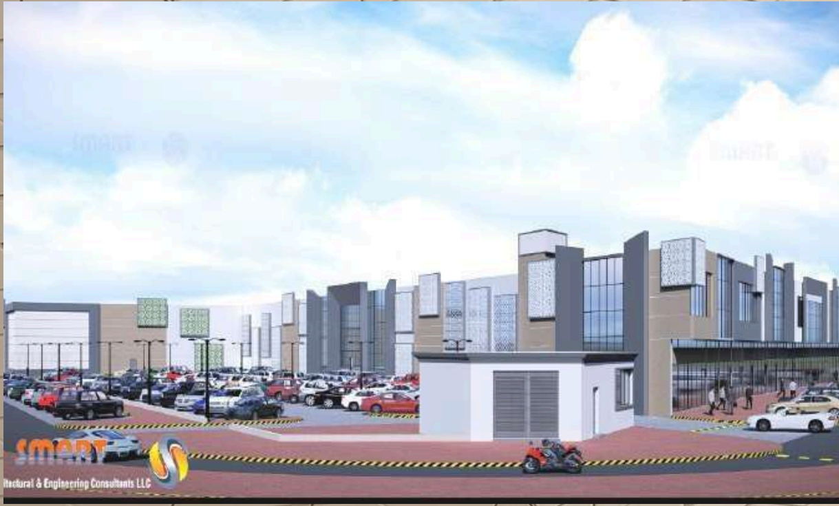
2384 (G+1) BUILDING+SHOWROOM MOWAIHAT 3