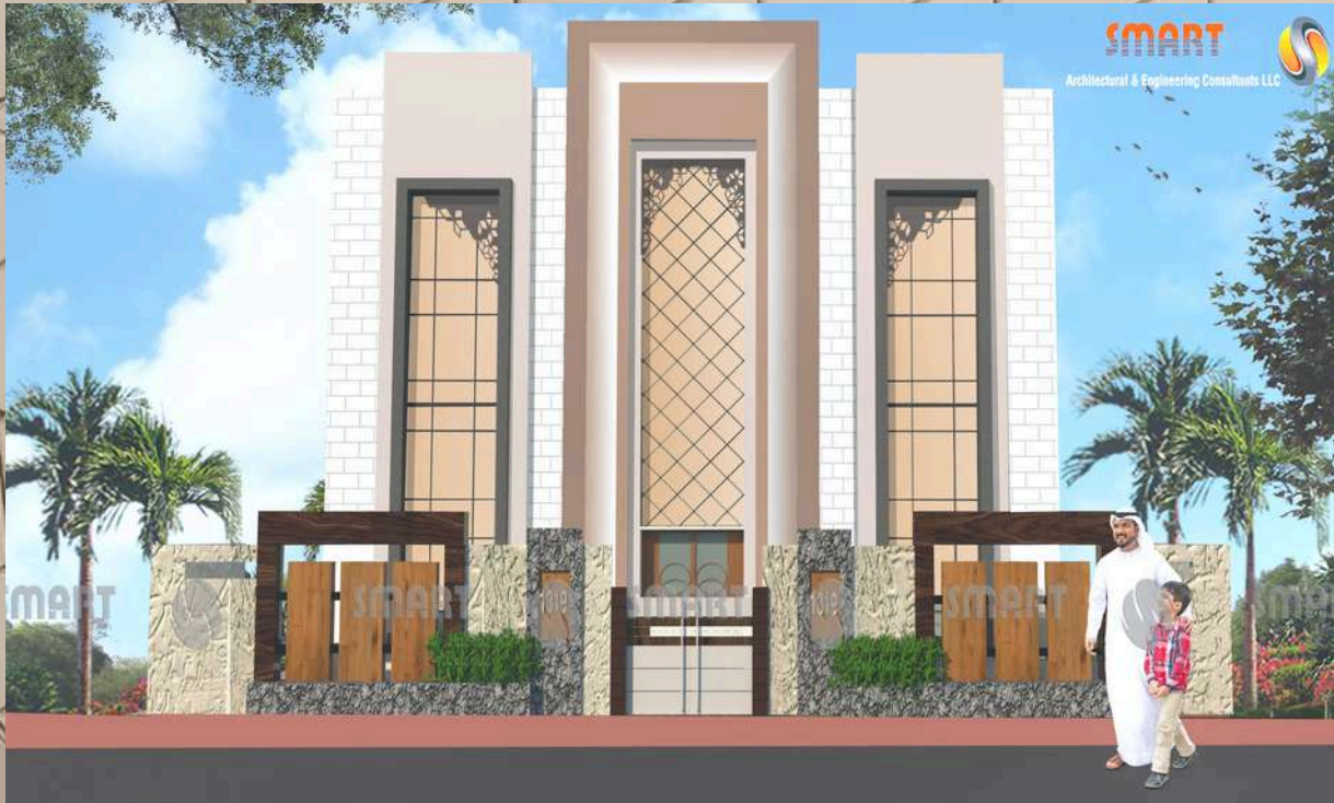
1319 (G+1) VILLA YASMEEN