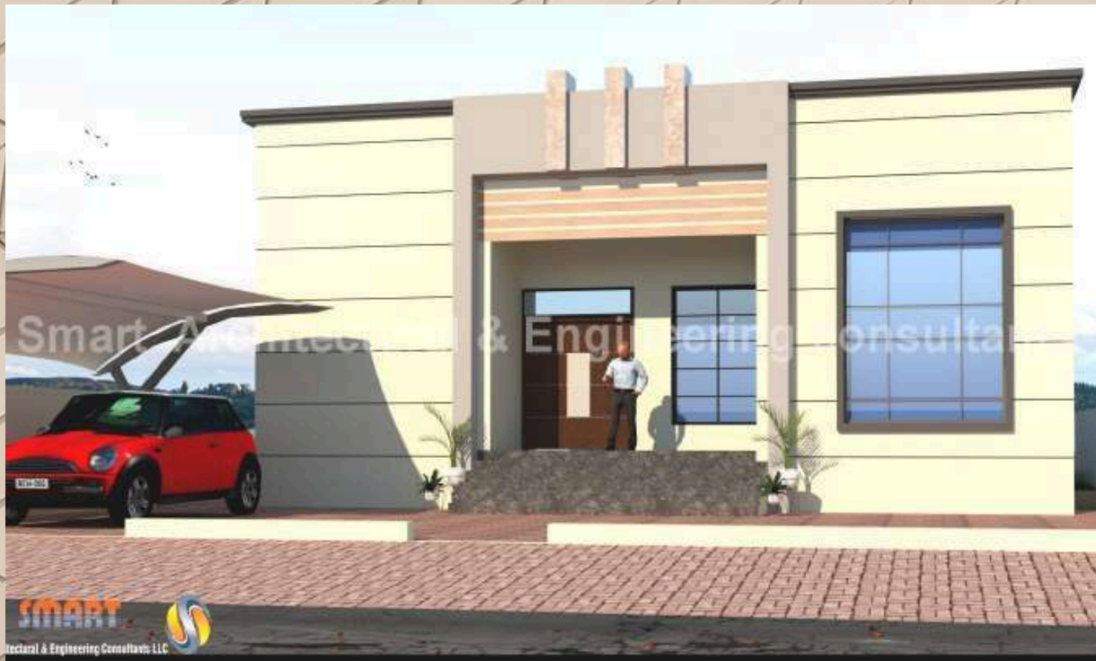
0524 (GF) VILLA MANAMA