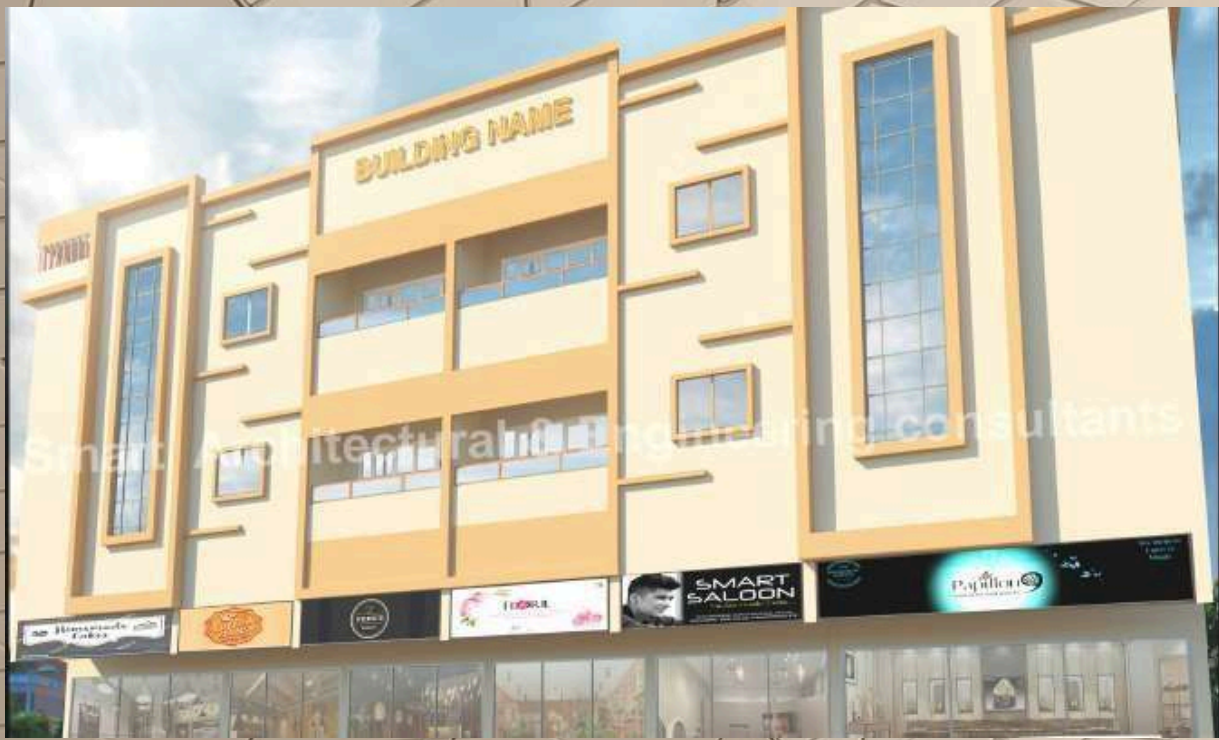
0392 (G+2) MOWAIHAT 2 AJMAN