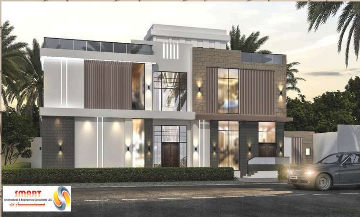
1948 (G+1) VILLA