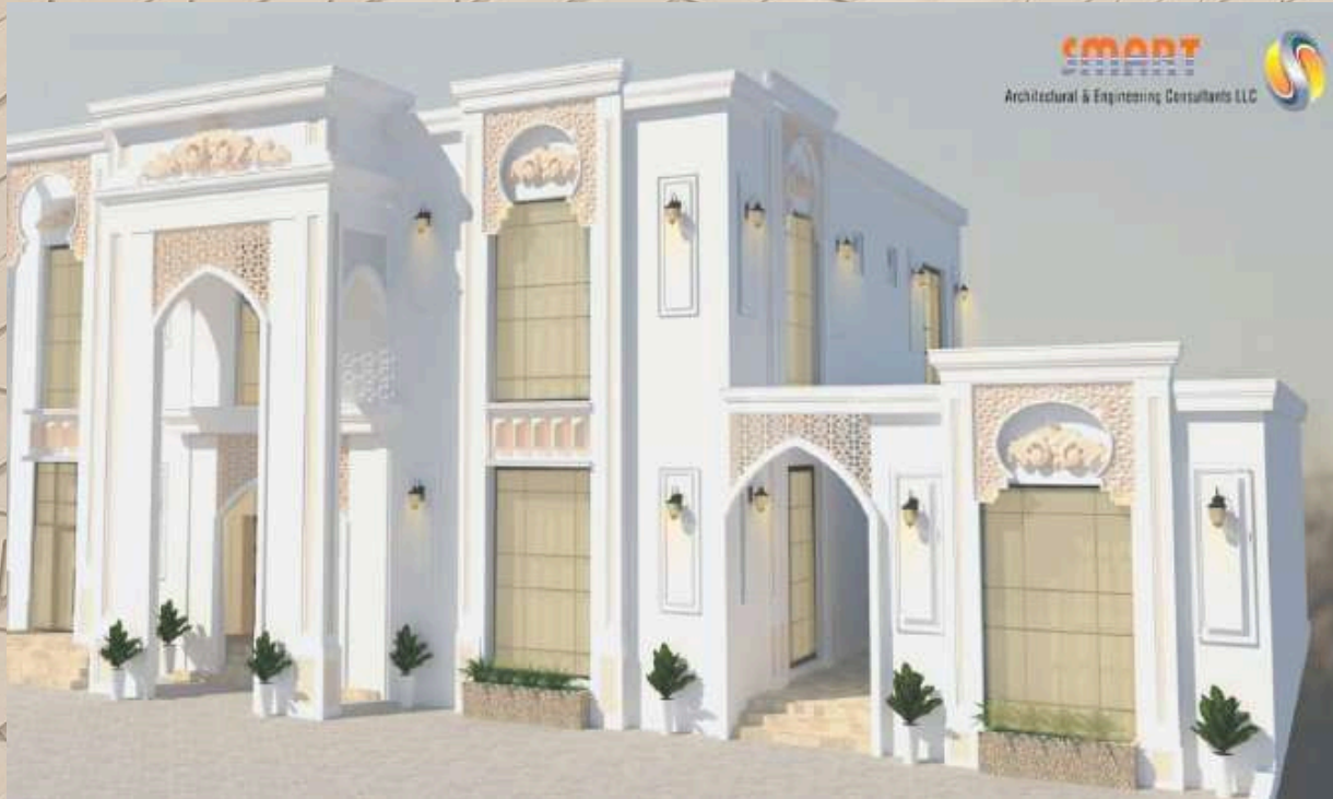
0669 (G+1) VILLA RAGAYEB 1