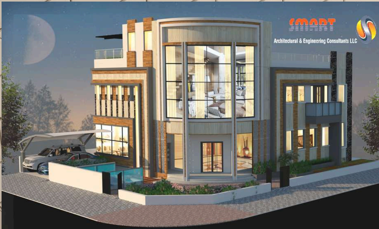
0730 (G+1) VILLA RAGAYEB 1