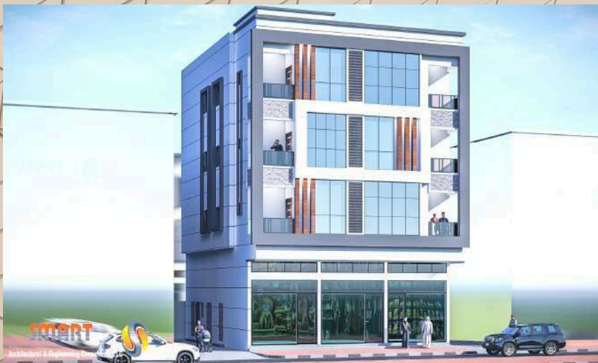
0859 (G+3) BUILDING AALIA AJMAN