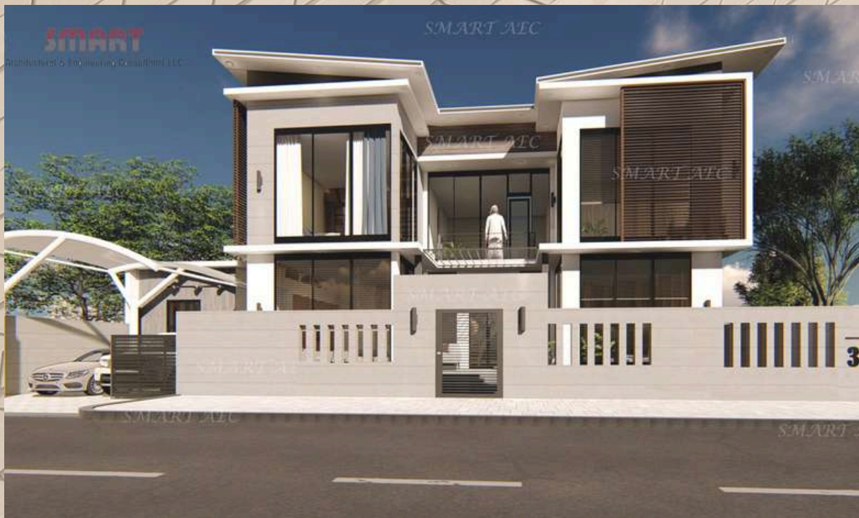
1988 (G+1) VILLA