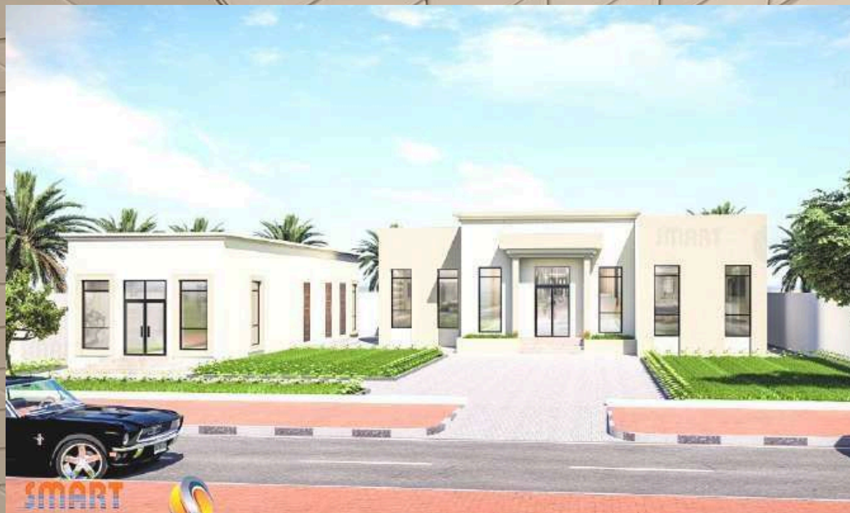
GF VILLA 0064 MANAMA