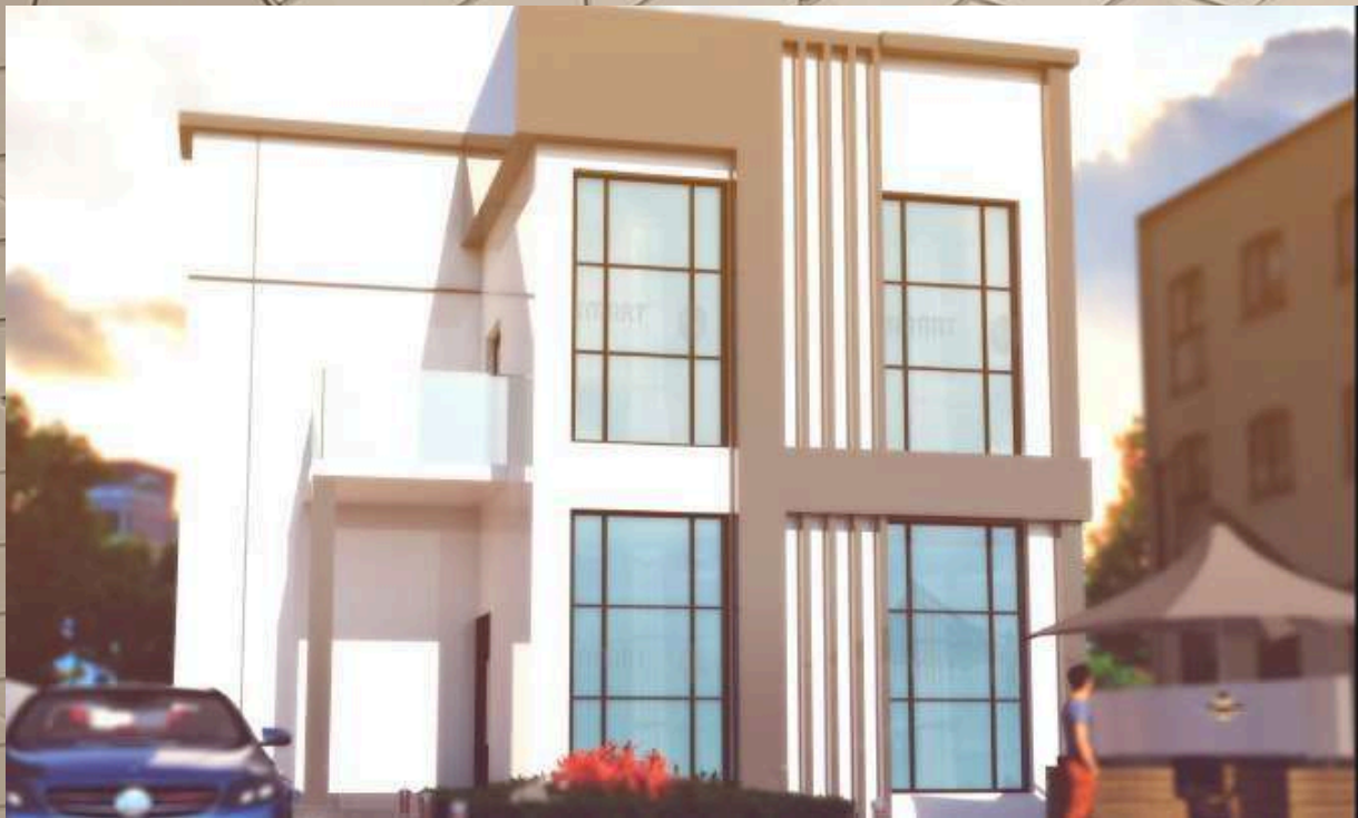
(G+1) VILLA JAWAHER