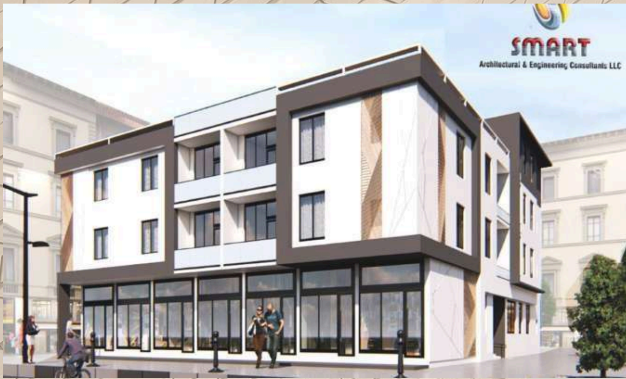
0896 (G+2+ROOF) RAWDHA-1 AJMAN