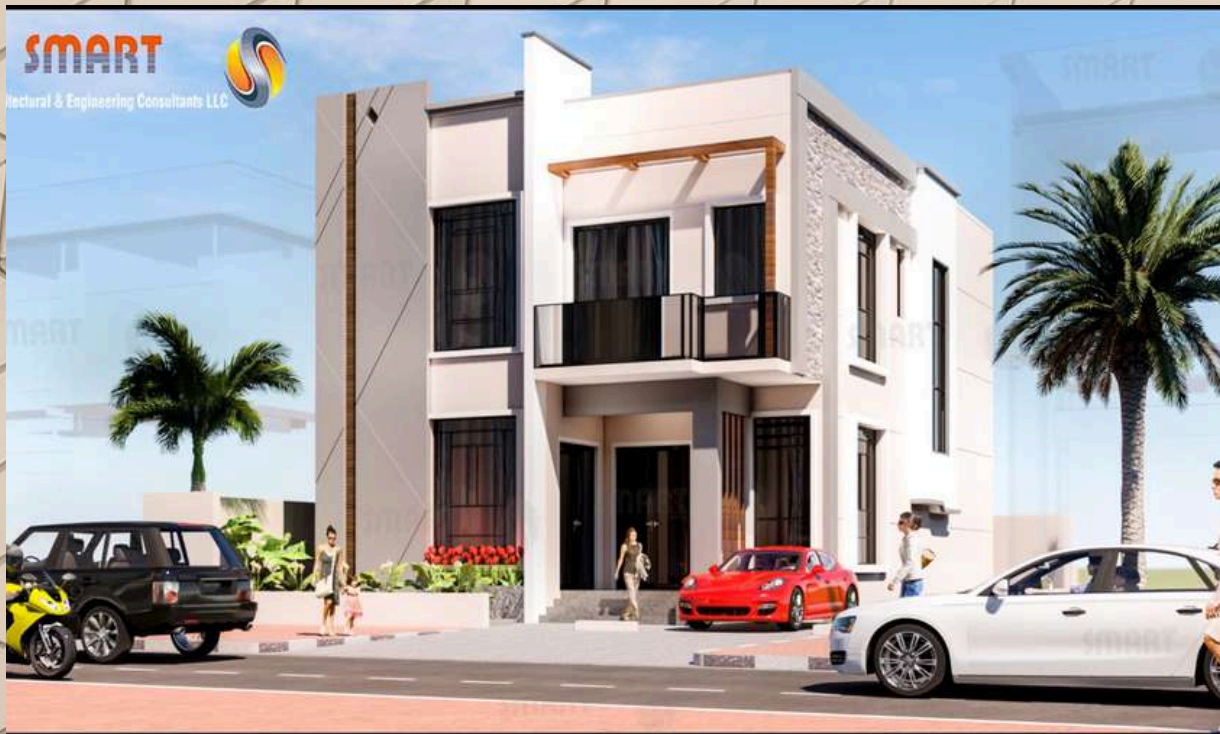
3028 (G+1) VILLA YASMEEN