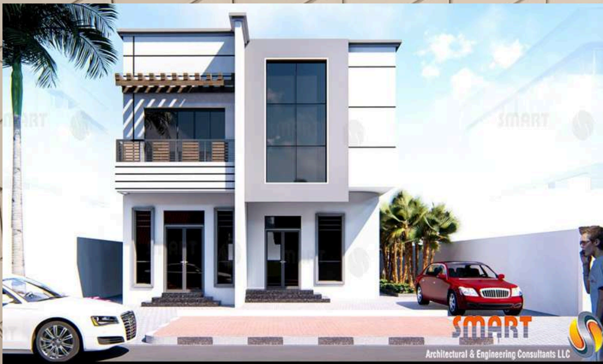
1157 & 1150 (G+1) VILLA YASMEEN