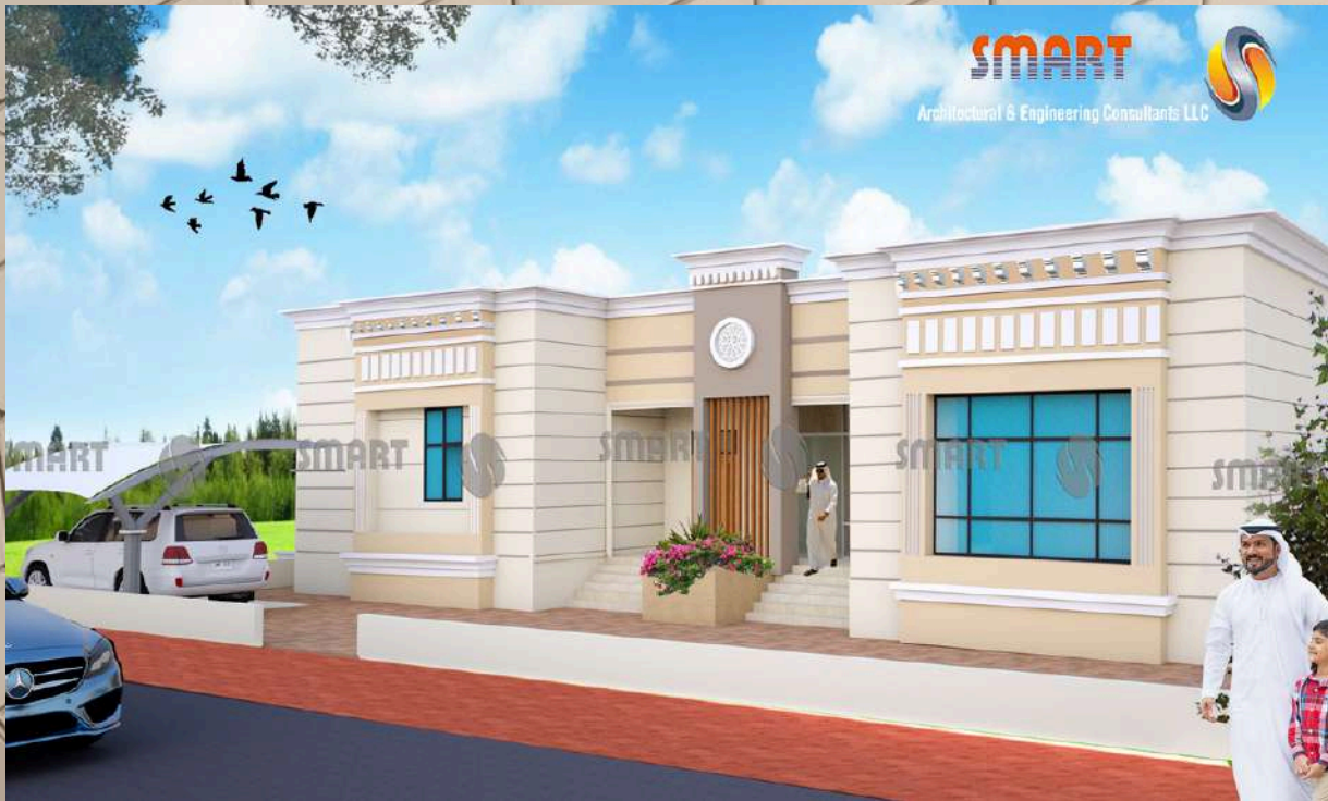
0908 (GF) VILLA SAFIA