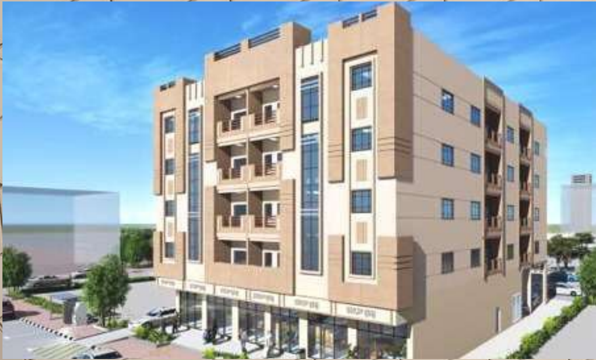
2189 (G+4) MOWAIHAT 2 AJMAN