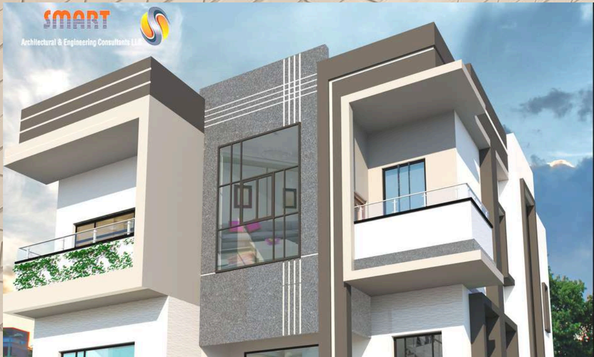
2270 (G+1) VILLA AALIA