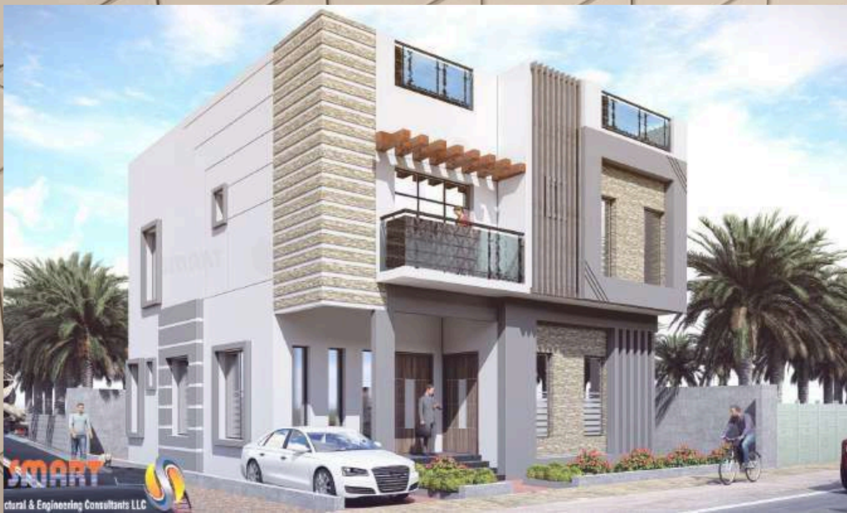
0685 (G+1 VILLA)