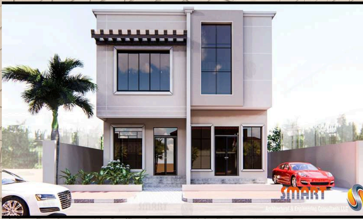
1098 (G+1) VILLA YASMEEN