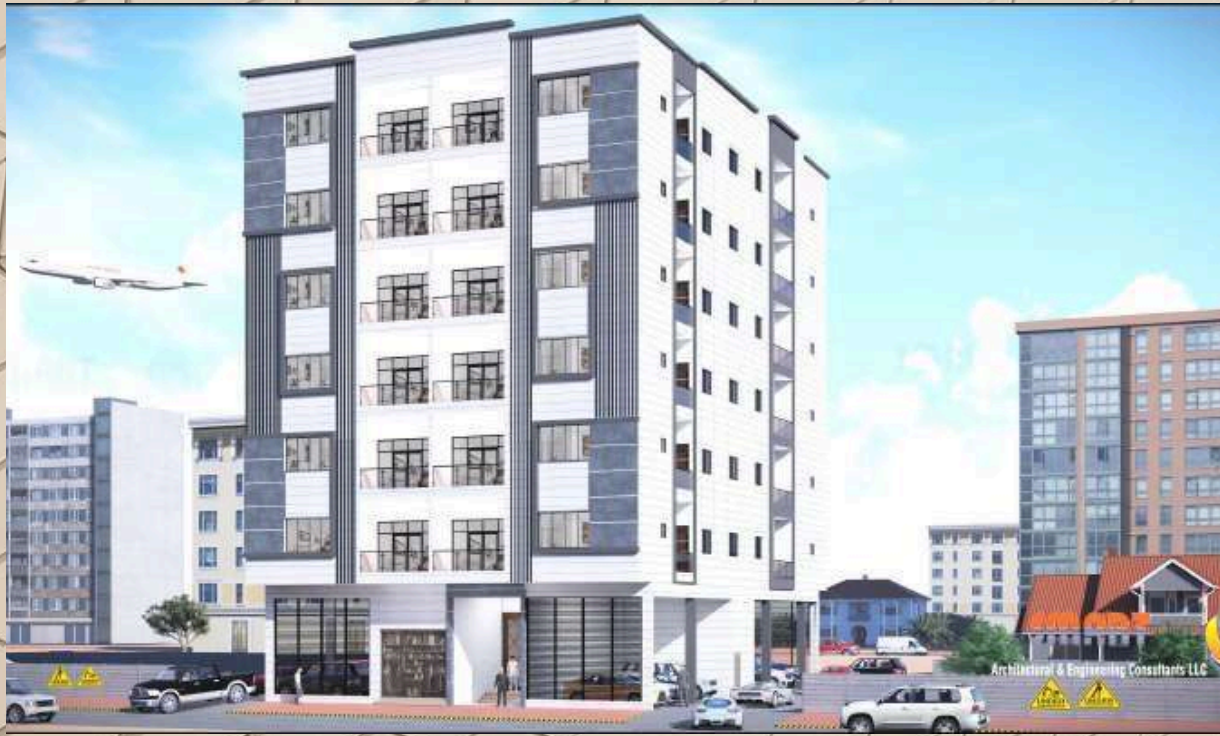
0270 (G+6) AL JURF 3 AJMAN