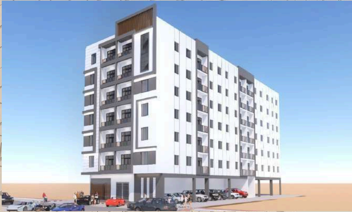
1121 (G+6) BUILDING HUMAIDEYA 1