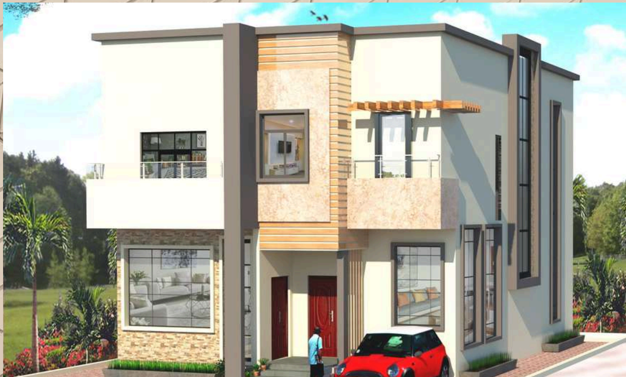
2883 (G+1) VILLA ZAHYA