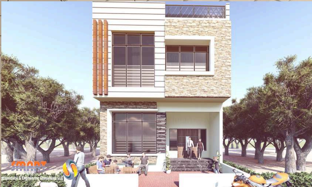
2574 (G+1) VILLA YASMEEN