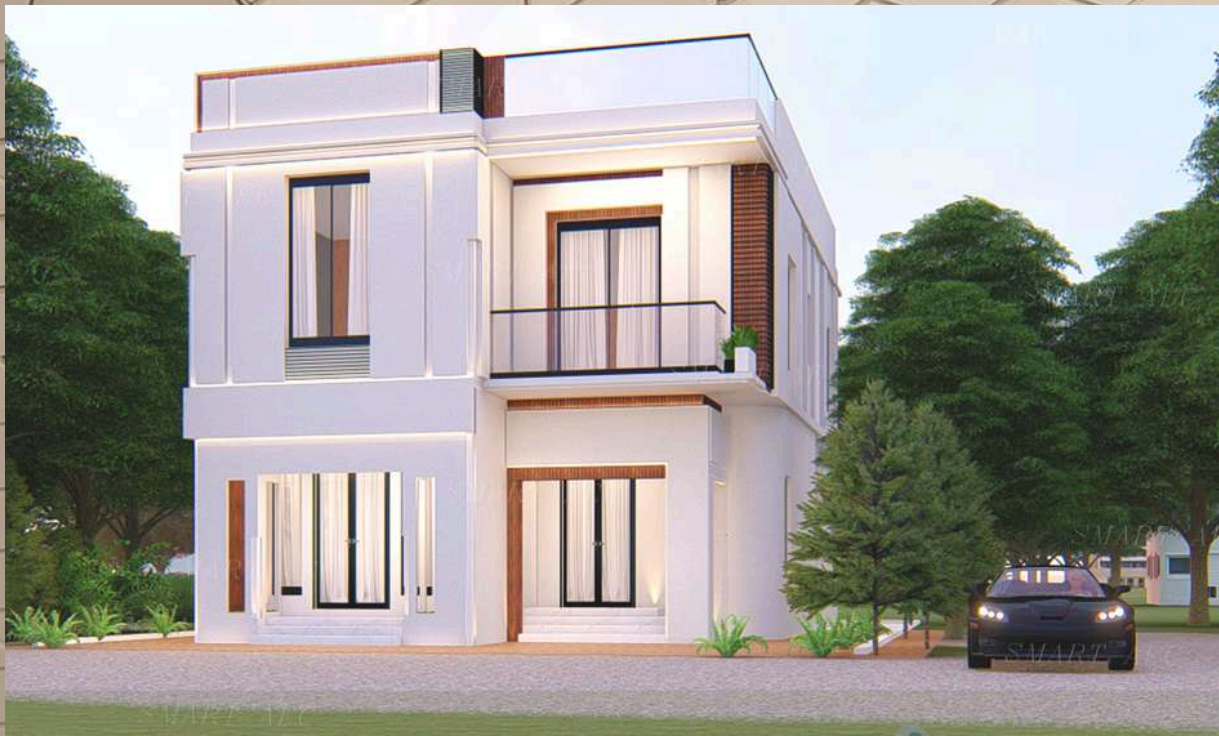
1838 (G+1) VILLA YASMEEN