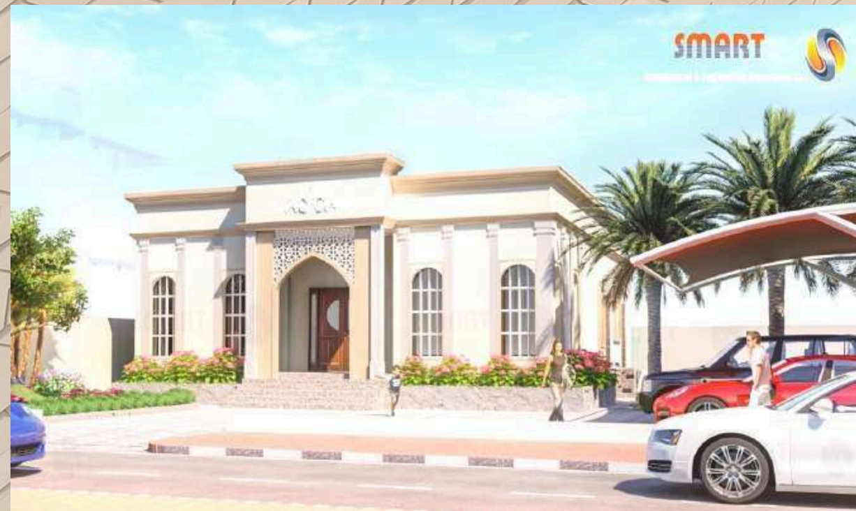
0286 GF VILLA RAGAYEB 2