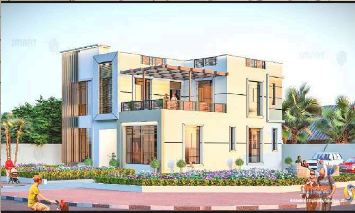
0380 (G+1) VILLA RAWDHAA 3