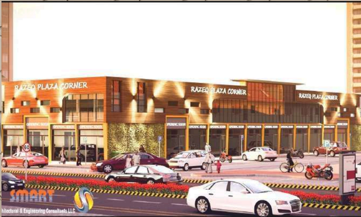
0104 (G+M) SHOP MUSHAIRIF