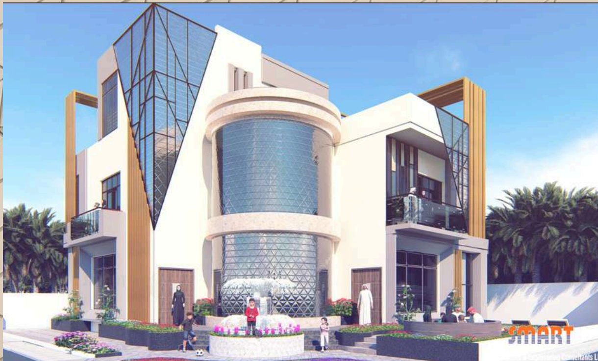
0395 (G+1) VILLA