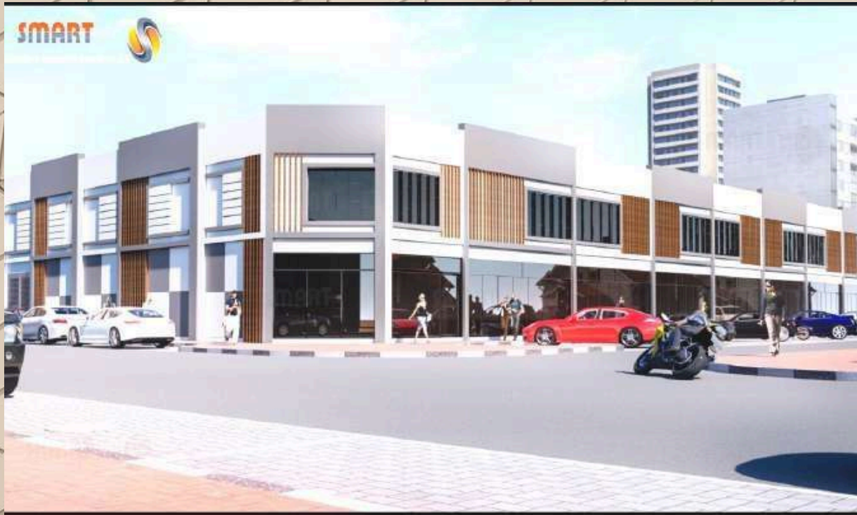
2180 (GF) SHOP YASMEEN