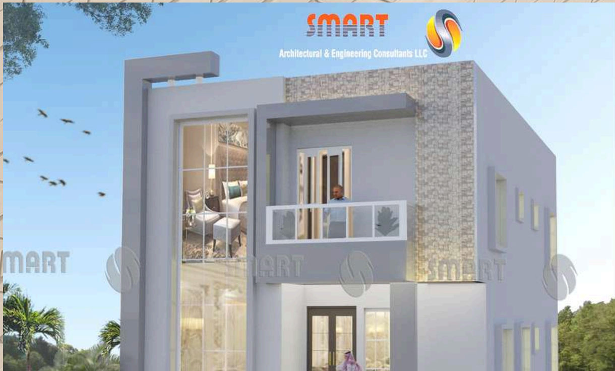
1897 (G+1) VILLA HELIO